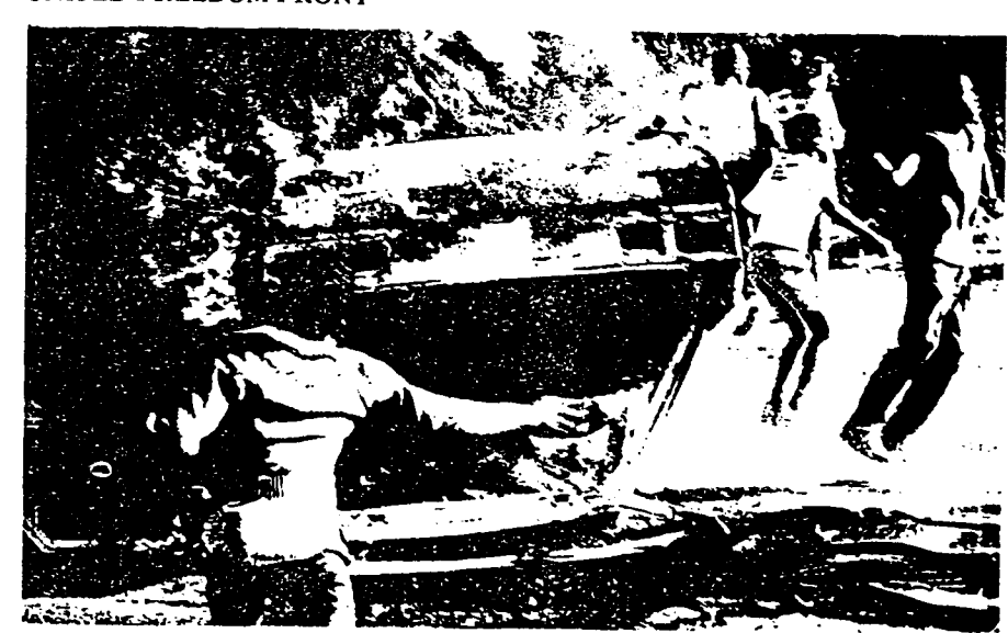
South Africa, August, 1985.