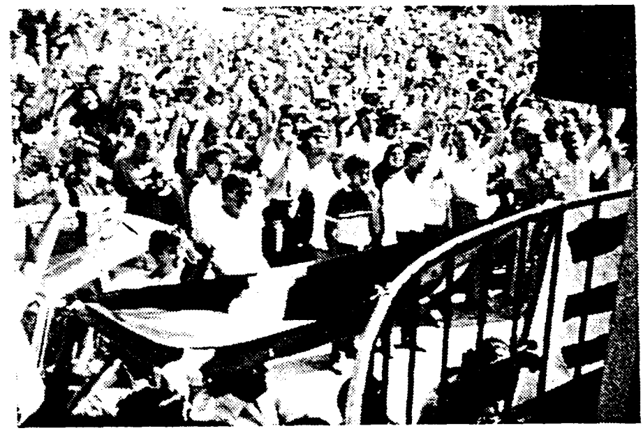
Thousands bonor the memory of Don Juan Antonio Corretjer, Puerto Rico's national poet and renowned revolutionary – January 1985.

For years, the inhabitants of the Puerto Rican islands of Culebra and Vieques have struggled against U.S. naval attacks on their islands — attacks that pockmark these islands with bomb craters, threaten to destroy the fishing industry, and force the inhabitants out of their homes. Determined struggles