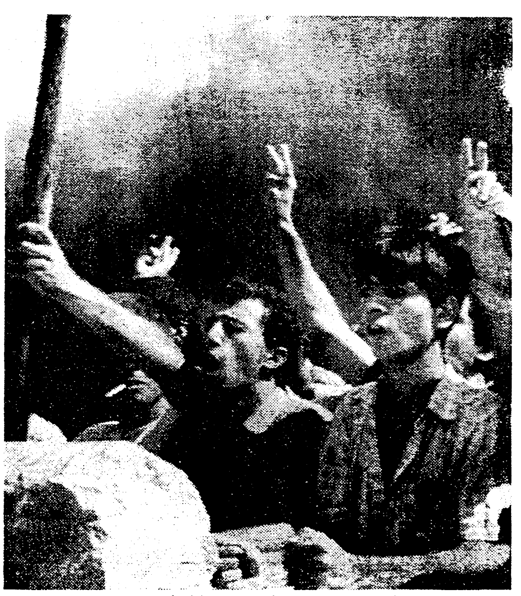
Palestinians protest planned visit by Meir Kahane to the West Bank.

IAI plays a central role in the arming of fascist governments around the world. When domestic and international pressure forced the U.S. to cut off arms to Somoza in Nicaragua and to the military dictatorship in Guatemala in the late 1970's,